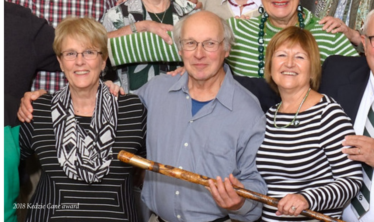
2018 Kedzie Cane award