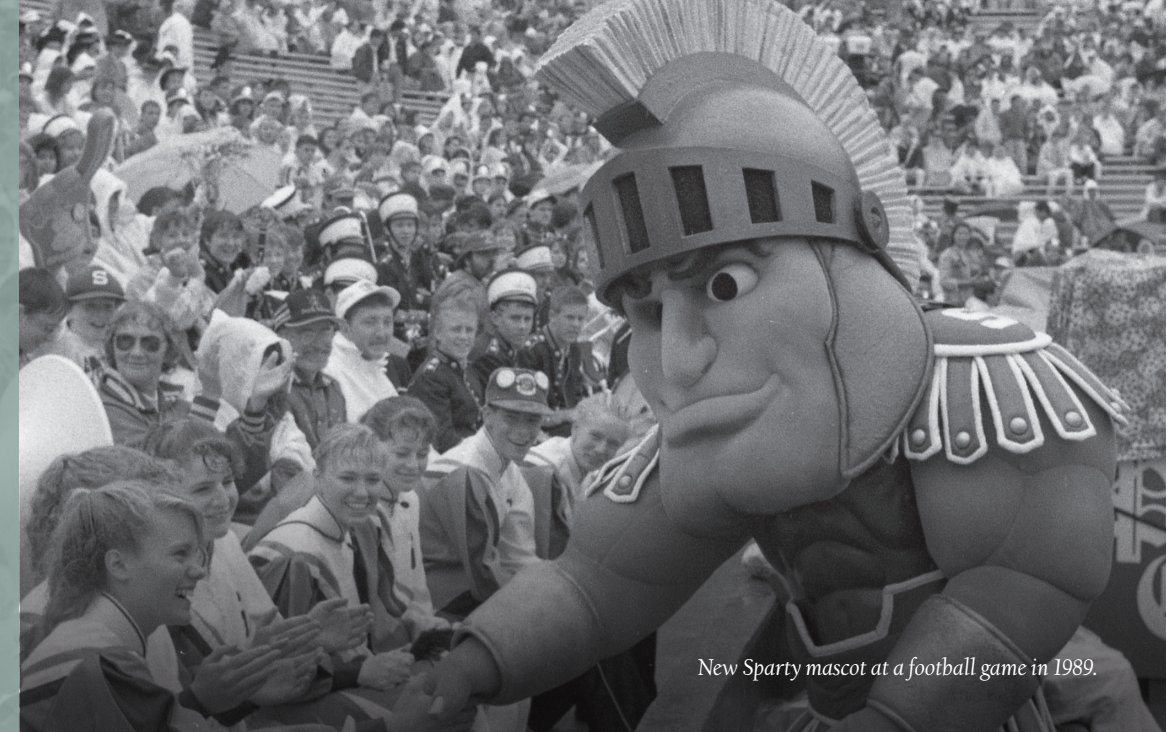
New Sparty mascot at a football game in 1989.