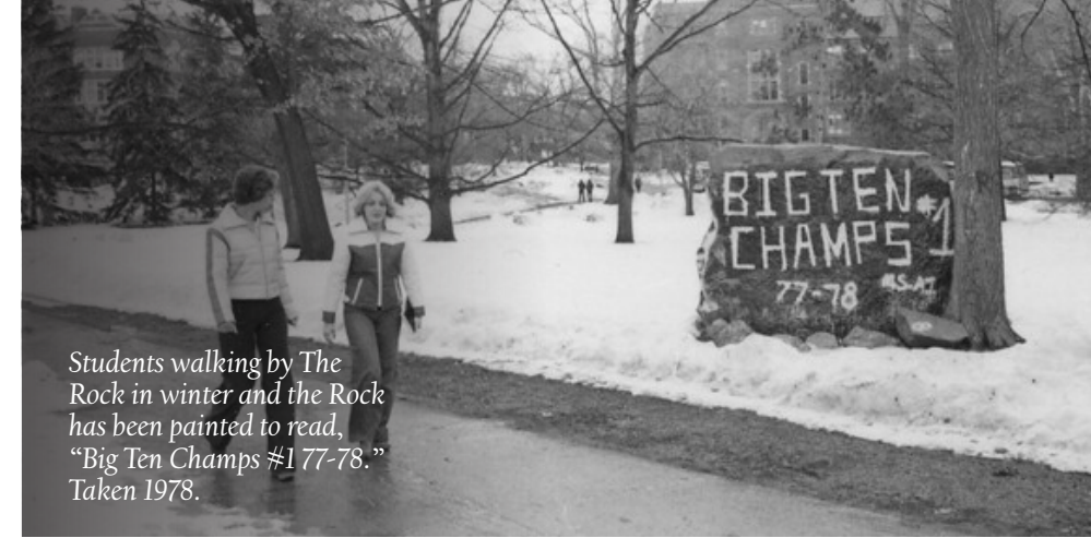
Students walking by The Rock in winter and the Rock has been painted to read, "Big Ten Champs #1 77-78." Taken 1978.