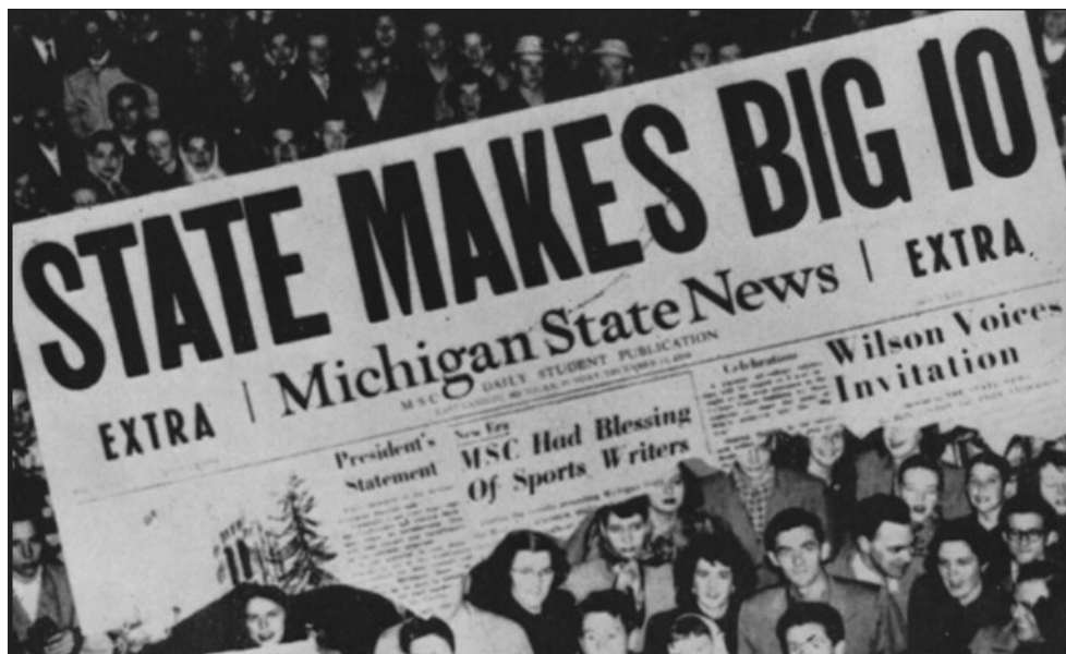
The photograph shows the lead headline of the 1948 State News Extra.