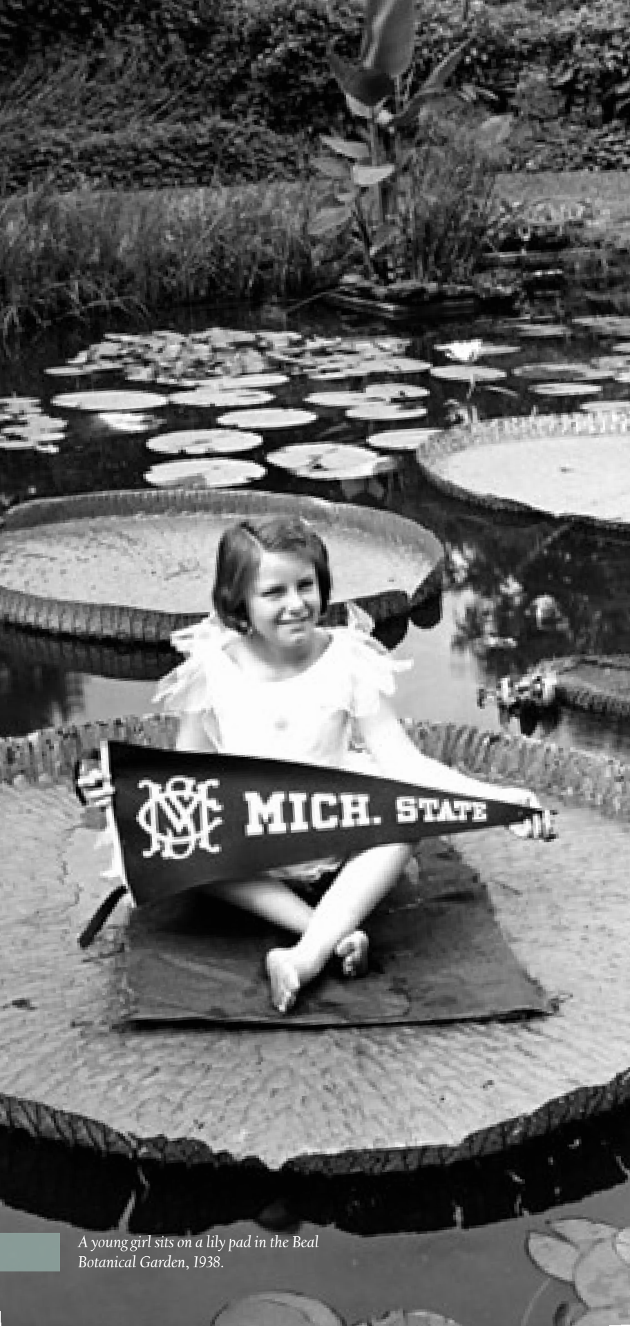
A young girl sits on a lily pad in the Beal Botanical Garden, 1938.