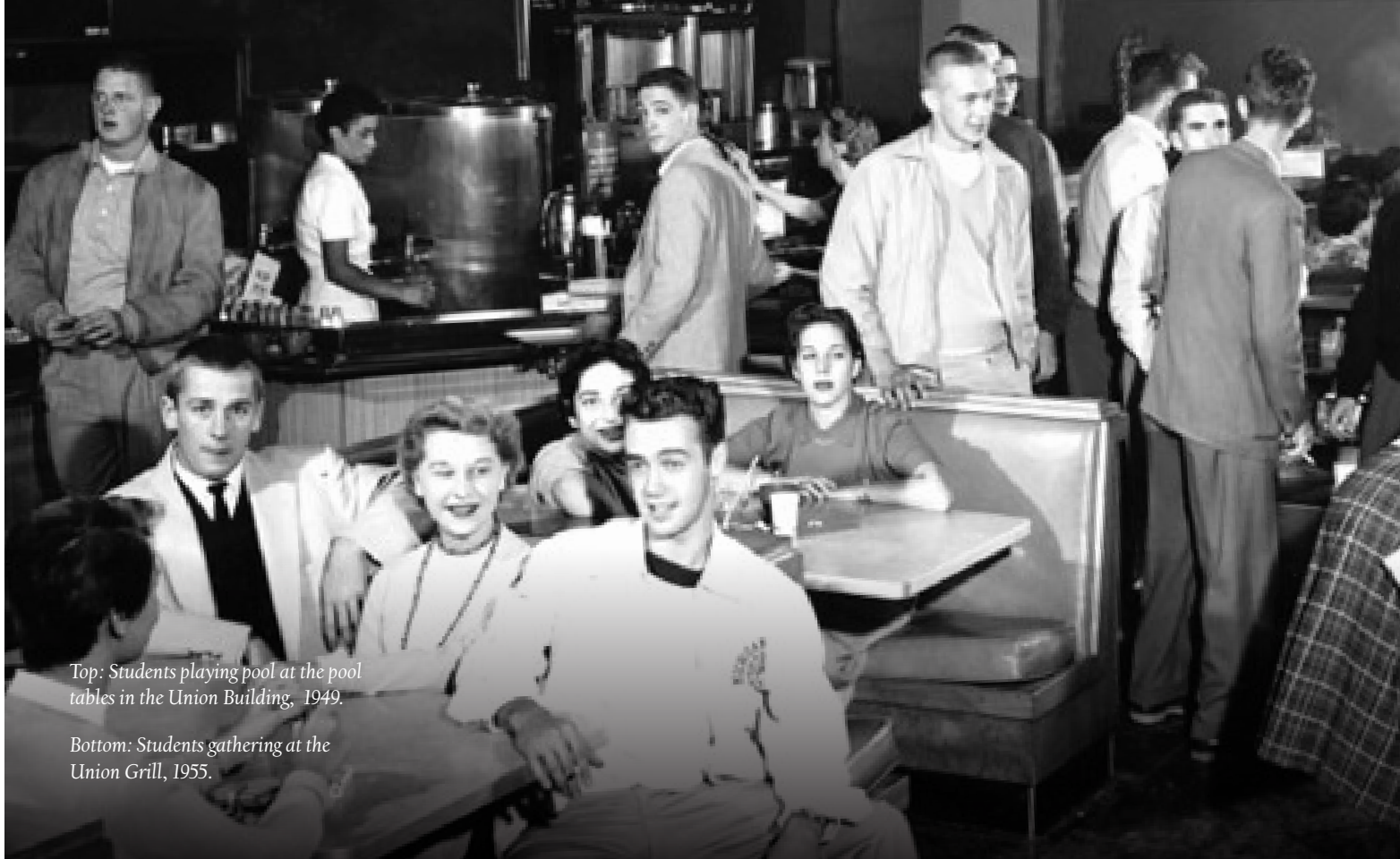
Top: Students playing pool at the pool tables in the Union Building, 1949.