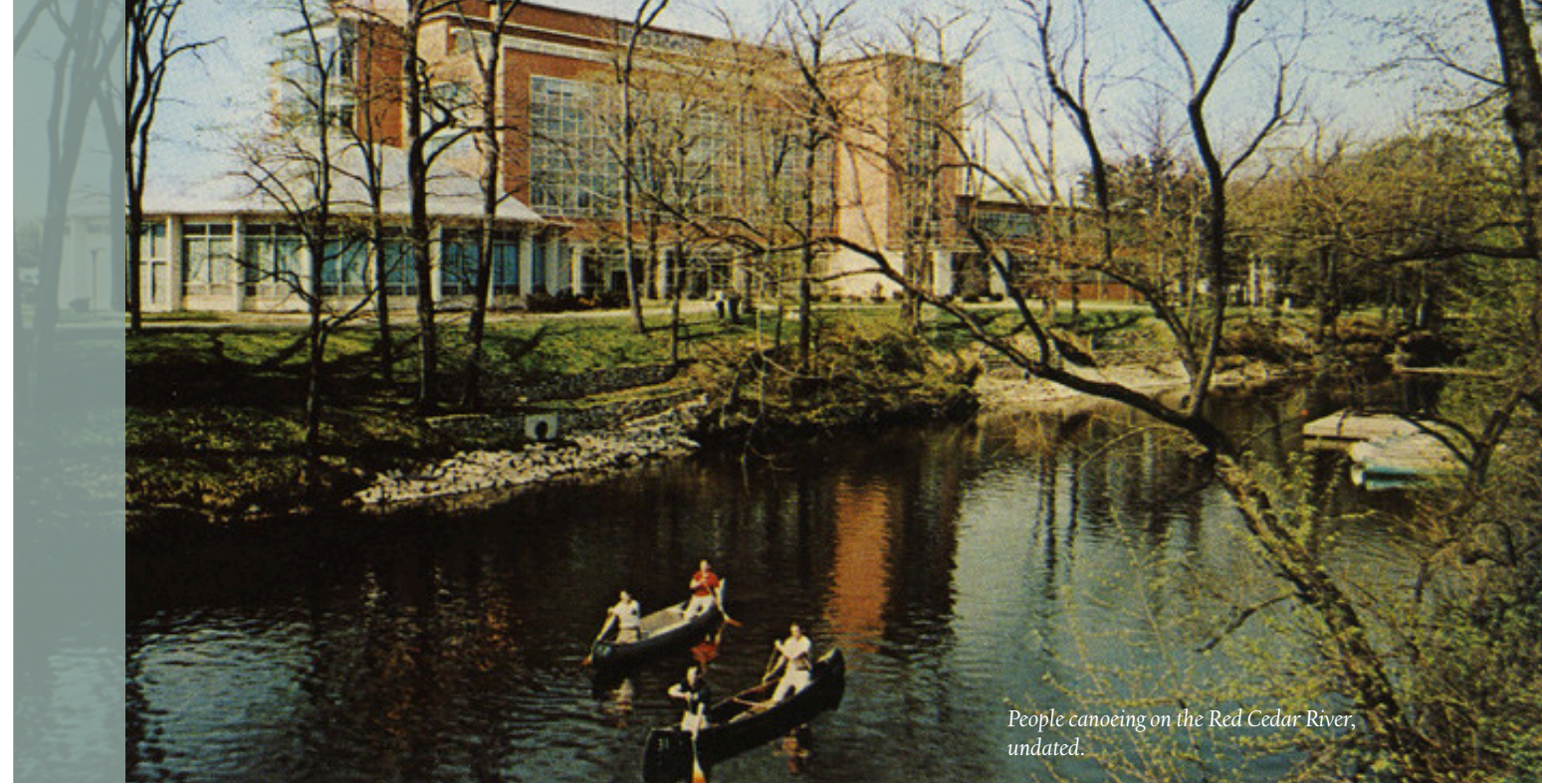
People canoeing on the Red Cedar River, undated.