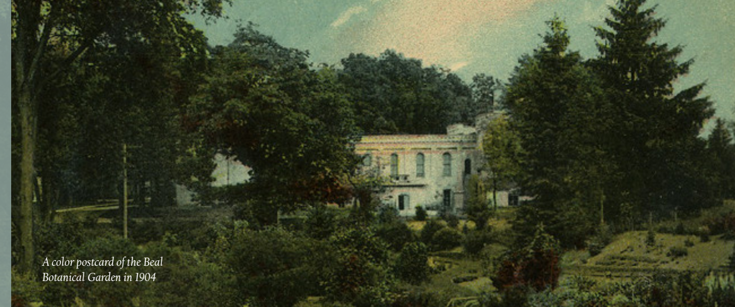
A color postcard of the Beal Botanical Garden in 1904

MSU is known far and wide for its beauty, and our William J. Beal Botanical Garden, Children’s 4-H Garden and Horticulture Gardens are three reasons why. The William J. Beal Botanical Garden started in 1873 and has been home to the longest running botany experiment in the world. A place of learning and exploration, the Beal Garden represents our deep connection between history and beauty. The Children’s 4-H Garden nurtures not only blossoming flowers but creativity. The garden was established in 1987 as a means of outreach and education to children, its four H’s standing for head, heart, hands and health – representing the whole person. It’s an imaginative place complete with treehouses, singing steps and a mini-maze. Right next to the 4-H Garden stands the Horticulture Gardens, complete with annual and perennial gardens, a rose garden and a vegetable garden. With a highly ranked horticulture program, MSU values these gardens as a means of education as well as pleasure. Just as previous Spartans have walked through these gardens over the years, take a walk to connect with the university and experience both its history and beauty.