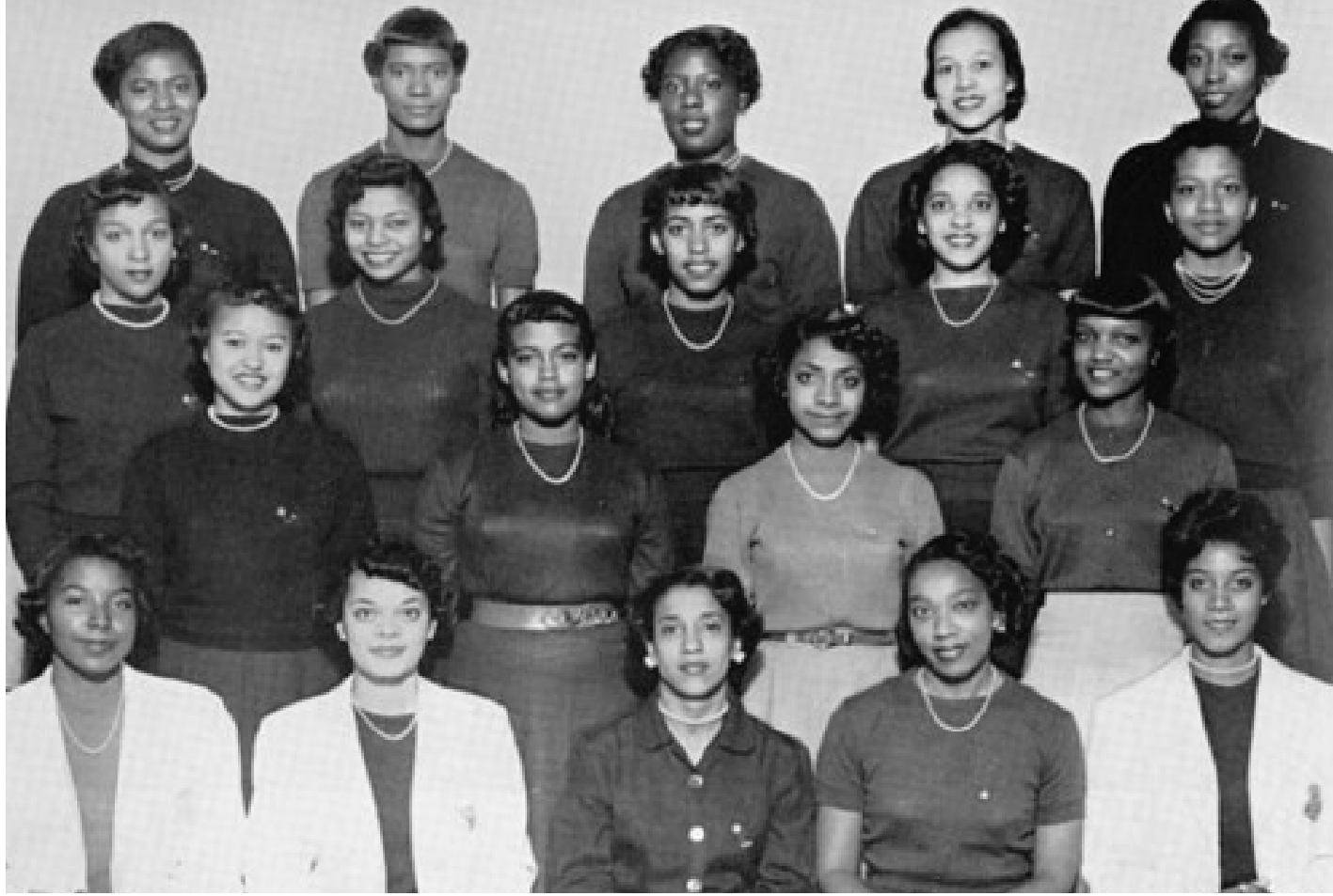
Members of the Alpha Kappa Alpha sorority pose for the 1955 Wolverine. Alpha Kappa Alpha was the first sorority for African American women on the MSU campus. The sorority was formed on Feb. 3, 1954, and this is either the charter group or first group after.