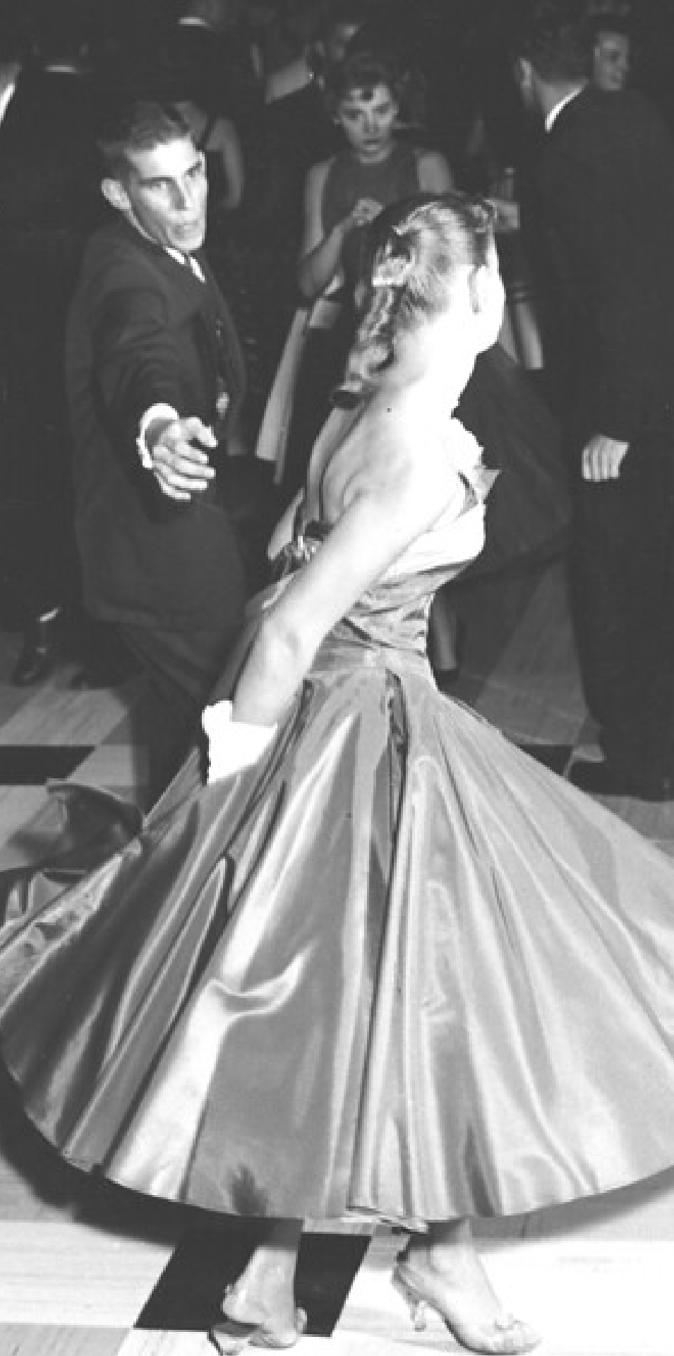
A couple dances at a 1958 Michigan State University dance.