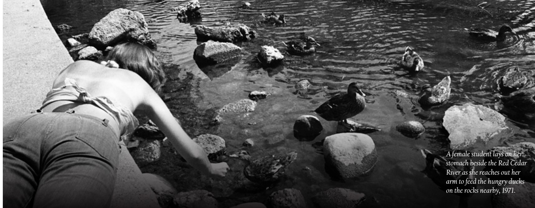
A female student lays on her stomach beside the Red Cedar River as she reaches out her arm to feed the hungry ducks on the rocks nearby, 1971.