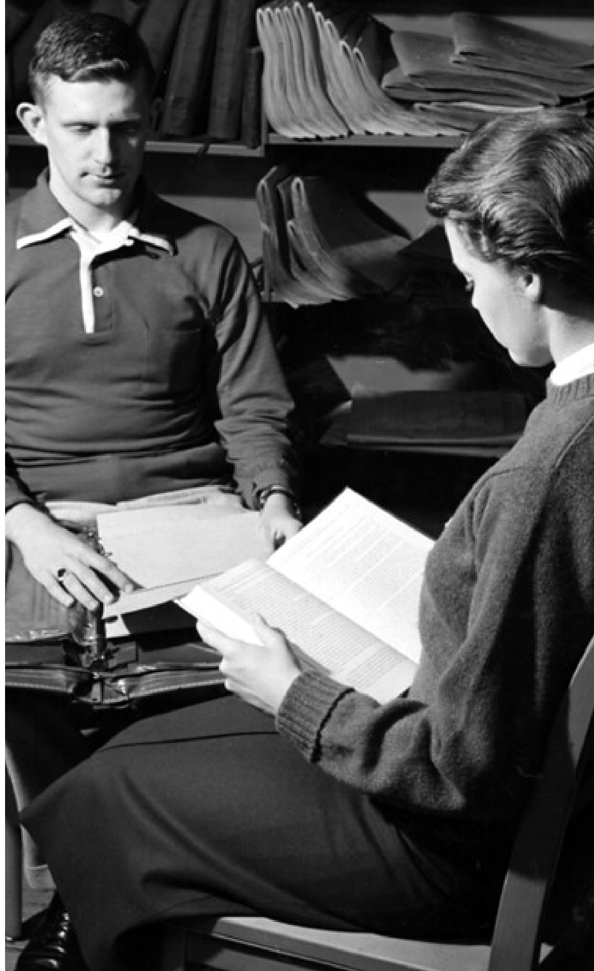
A Tower Guard student reads to a blind student, 1956.

The Black Power Rally (BPR) has become a tradition in the Black community at Michigan State University since the early beginnings of the Black Student Alliance, circa 1969. Every year, students involved with the organization come together with a sense of stern consciousness and urgency in concern of the state of Black America. BPR is an event that is hosted to cultivate awareness about the histories, narratives and everyday experiences of African and African-descended people through the mediums of art, music, dance, spoken-word poetry and intellectual skits, all of which are produced and executed by students across campus. In general, BPR strives to ignite social activism and coalition building across identities at MSU. Not only is the rally an arena to spread consciousness, it is a celebration of blackness. Since the start of the BPR, Black figures from all over the country have participated in this event, including Dick Gregory, Sister Souljah, Dead Prez and Jeff Johnson.