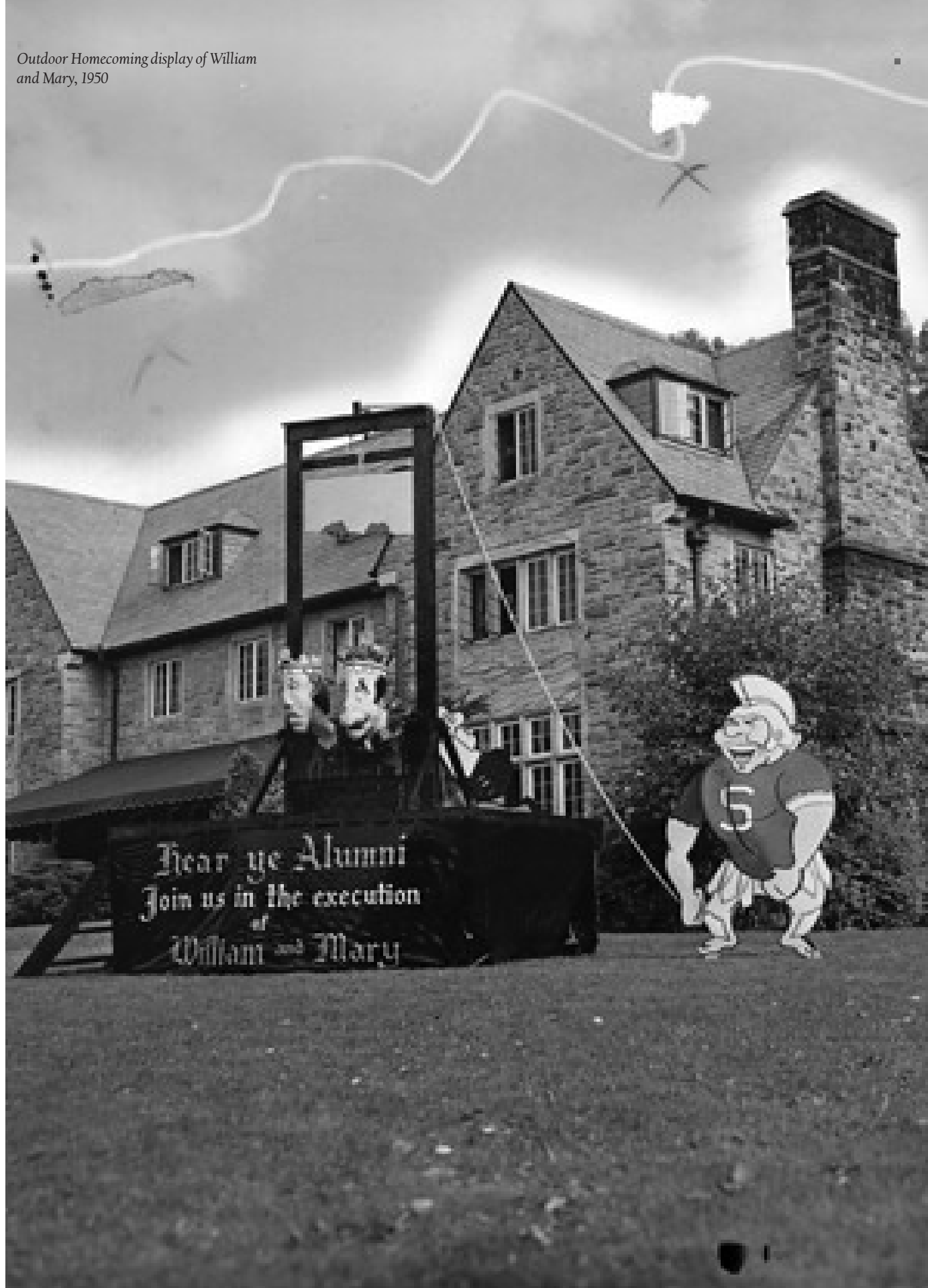
Outdoor Homecoming display of William and Mary, 1950