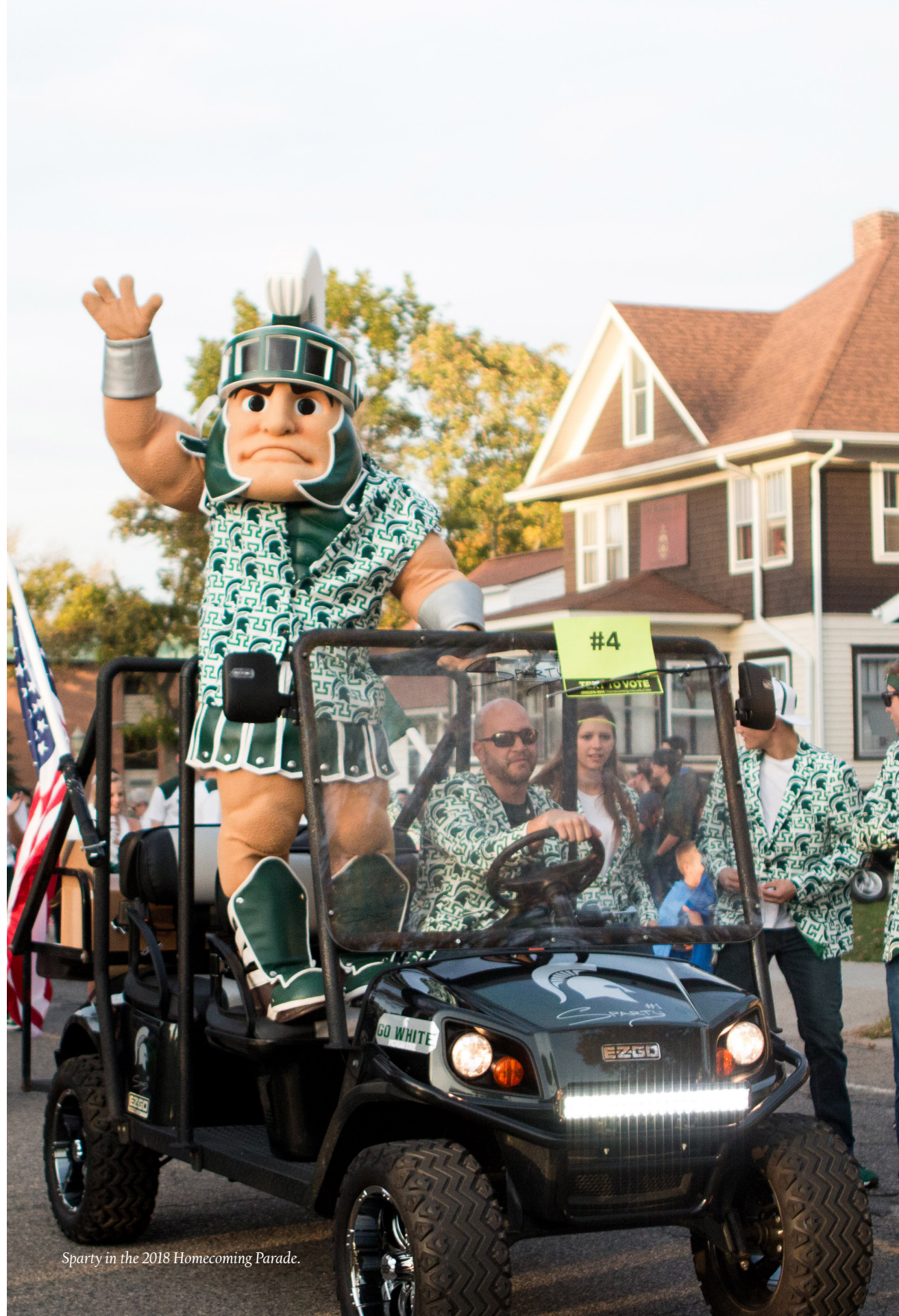
Sparty in the 2018 Homecoming Parade.