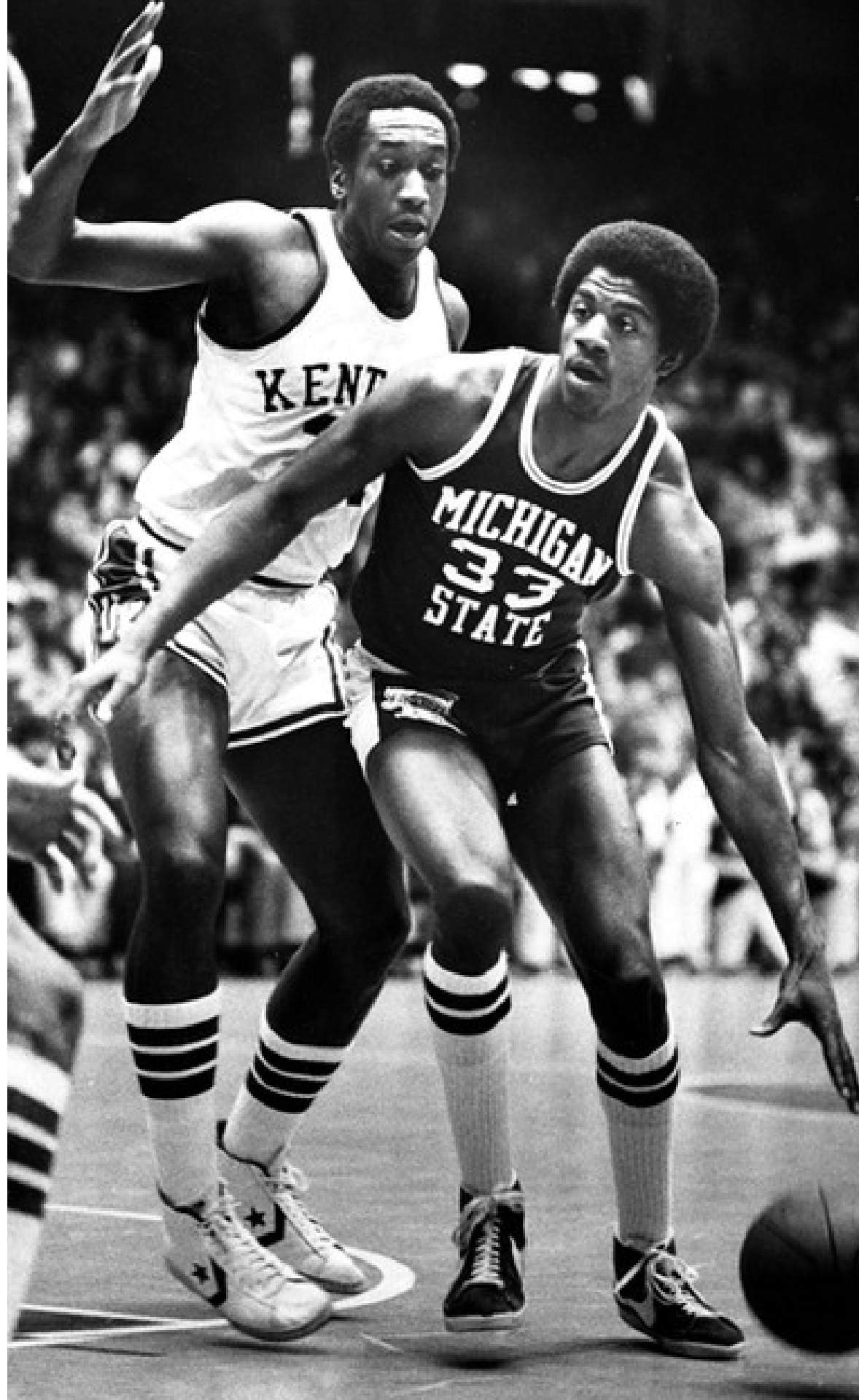
Earvin "Magic" Johnson dribbles the ball in a Michigan State University vs. Kentucky basketball game, 1978.

A huge part of going to a Big Ten school is the outstanding athletic programs. Although Michigan State has various opportunities for student involvement, student sections at athletic events are an unparalleled experience. If you're lucky, you may even see worlds collide like when Coach Izzo sat among the football student section after a weather evacuation. Get all the latest info at msuspartans.com .